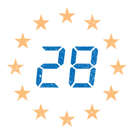
All 28 EU states are now working towards a pan-European data protection framework

The good news for tech companies is that the actions they need to take to secure data from a regulatory standpoint are about the same as the actions they should have taken to ensure adequate protection anyway. This does, however, require different controls depending on a range of variables (see box). As companies grow and rely on expanded networks and supply chains, the risks become more complex. Hackers breached Target's systems, for example, using network credentials stolen from a third-party vendor.